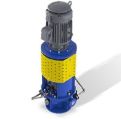
OH3 - VERTICAL IN-LINE PUMP