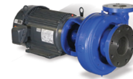
GH - HORIZONTAL END-SUCTION PUMP