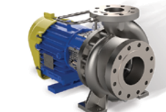
MAXUM OH1- HEAVY- DUTY, HORIZONTAL END-SUCTION PUMP