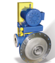
855 - TANK- MOUNTED FILTRATE PUMP