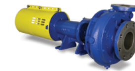
850 - HORIZONTAL FILTRATE PUMP