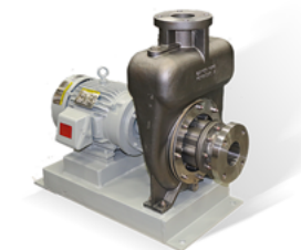
KFP - SELF PRIME PUMP