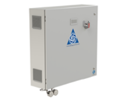
DELTA P - UL508A LISTED CONTROL PANELS