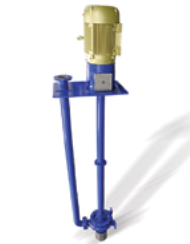
G2S - VERTICAL SUMP PUMP