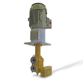
VLO - VERTICAL LUBE OIL PUMP