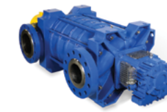
RS - MULTISTAGE RING SECTION PUMP