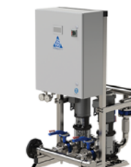
DELTA P - PACKAGED PUMP SYSTEM