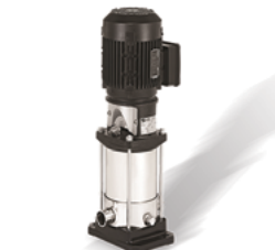
RSV - VERTICAL IN-LINE MULTISTAGE PUMP