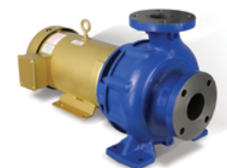
KWP - NON-CLOGGING PROCESS PUMP