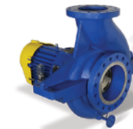
API MAXUM OH2 - END-SUCTION PUMP