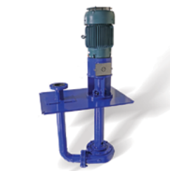
G2C - VERTICAL CANTILEVER PUMP