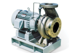
M SERIES - ASTM F998 CLOSE- COUPLED PUMP